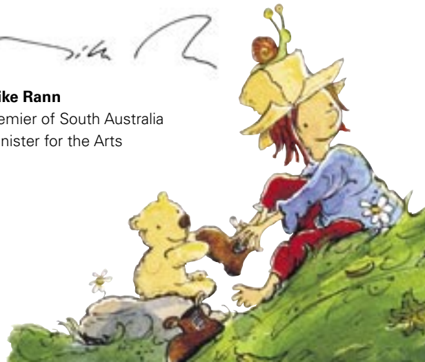
Mike Rann Premier of South Australia Minister for the Arts

A handwritten signature in black ink, appearing to read "Mike Rann".