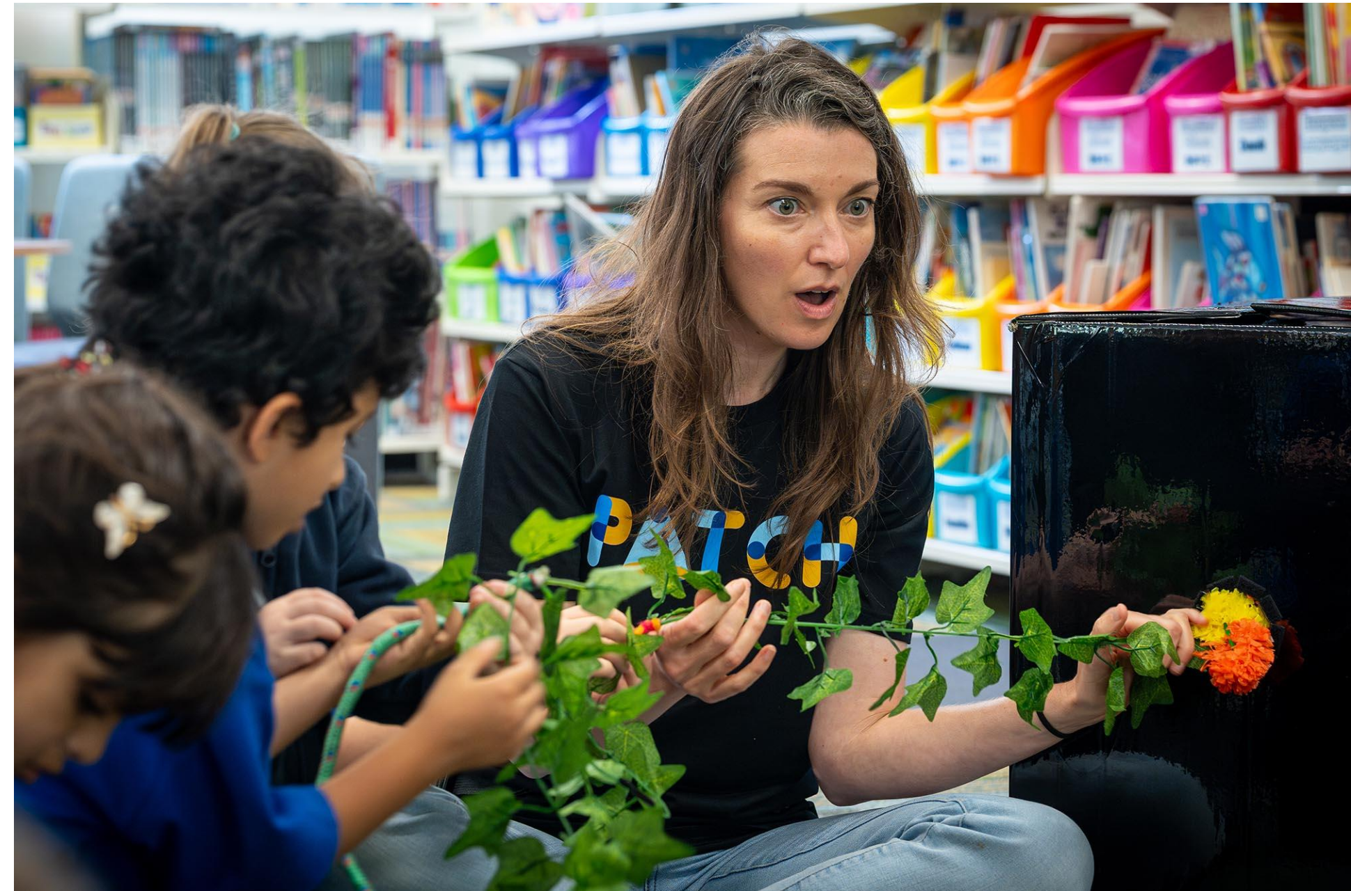
Image description: A person and children holding a string made of leaves, they looked surprised.