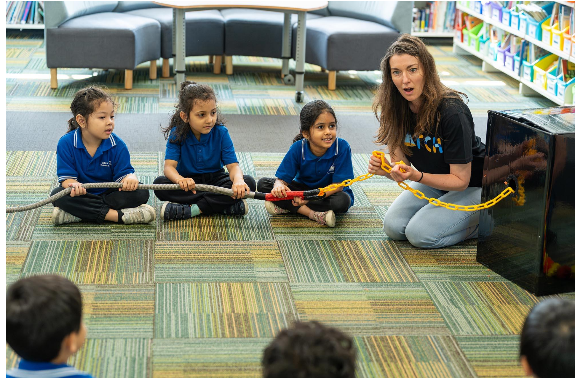
Image description: A group of children sitting on the floor with a person holding a rope and a chain.

If I don't like how the string feels, I don't have to touch it.