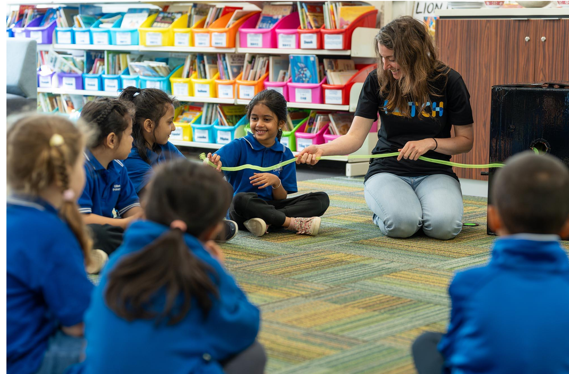
Image description: A group of children sitting on the floor with an adult holding a green string.

We will be pretending and enjoying ourselves.