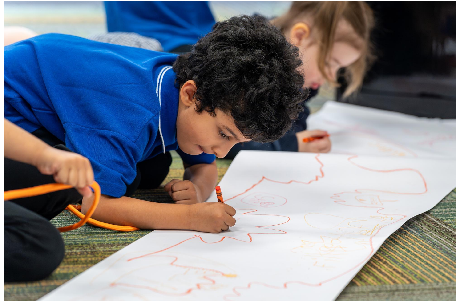
Image description: A child draws on a sheet of large white paper with an orange crayon.

Or I can draw something from my imagination.