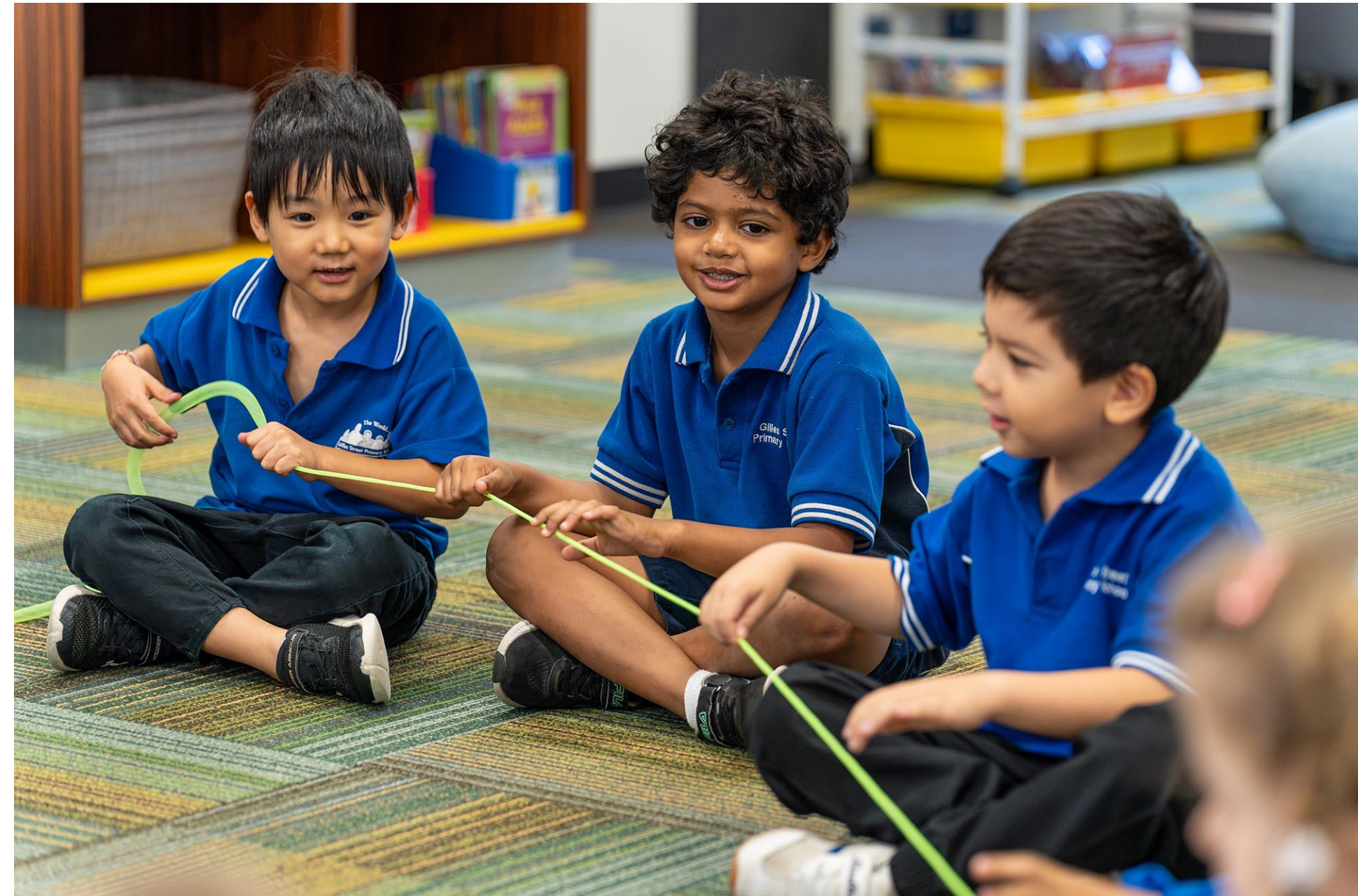
Image description: A group of children sitting on the floor holding a string