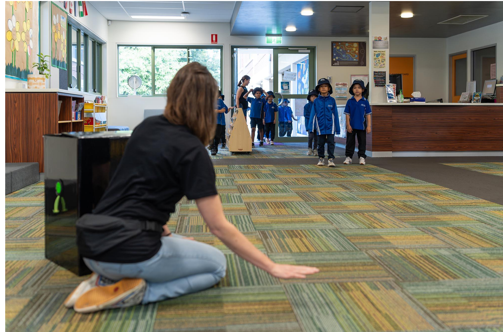
Image description: A person is kneeling on the floor in a library. She is welcoming a group of children.