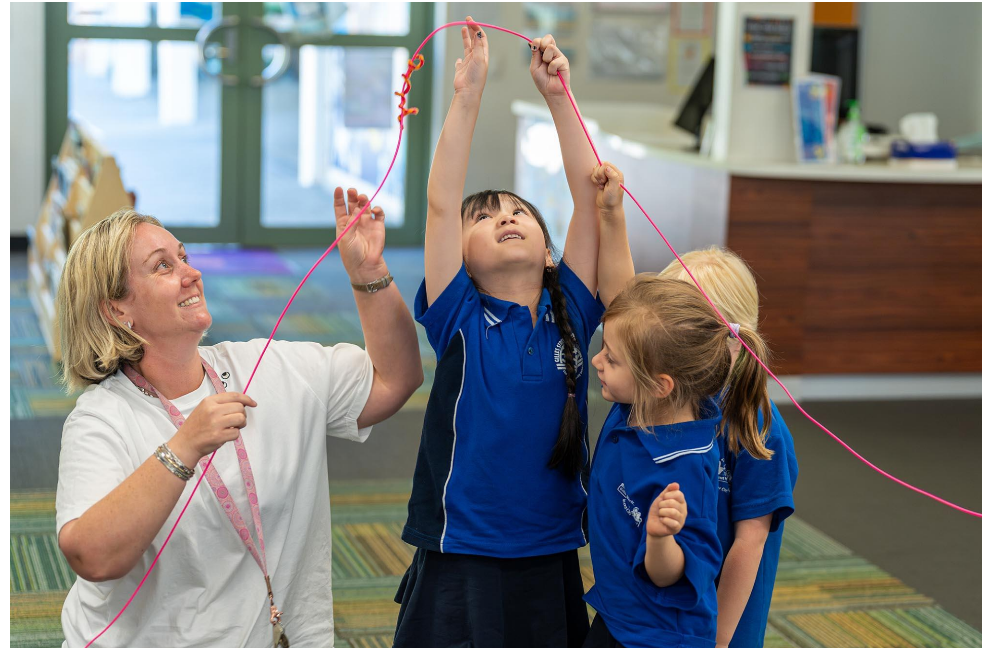
Image description: A teacher and a group of children play with a pink string.

Everyone experiences It's a String Thing in their own way.