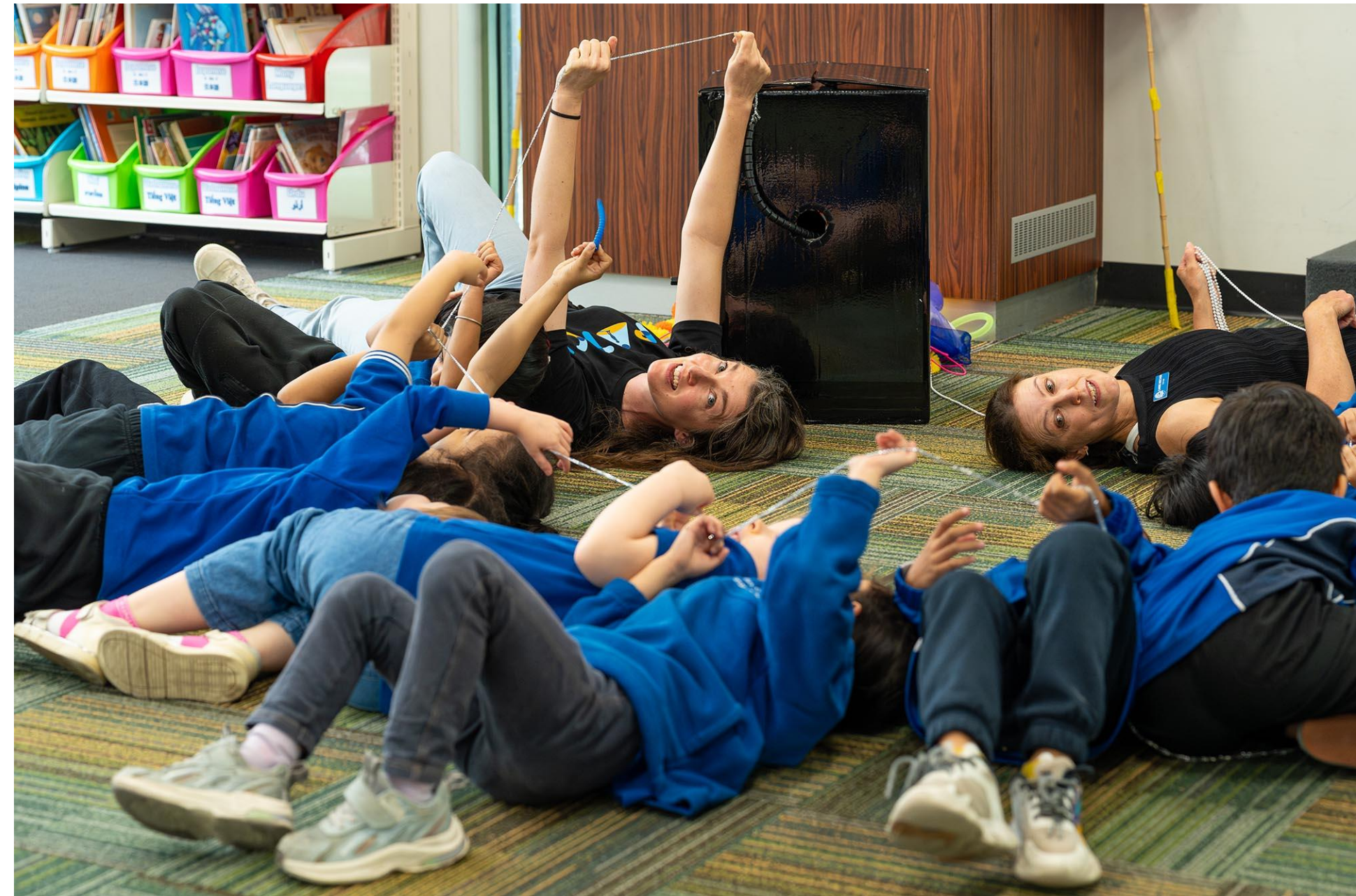
Image description: A group of people lying on the floor holding a silver string above their heads.

The performer may ask me to do things with the string. I can if I want to.