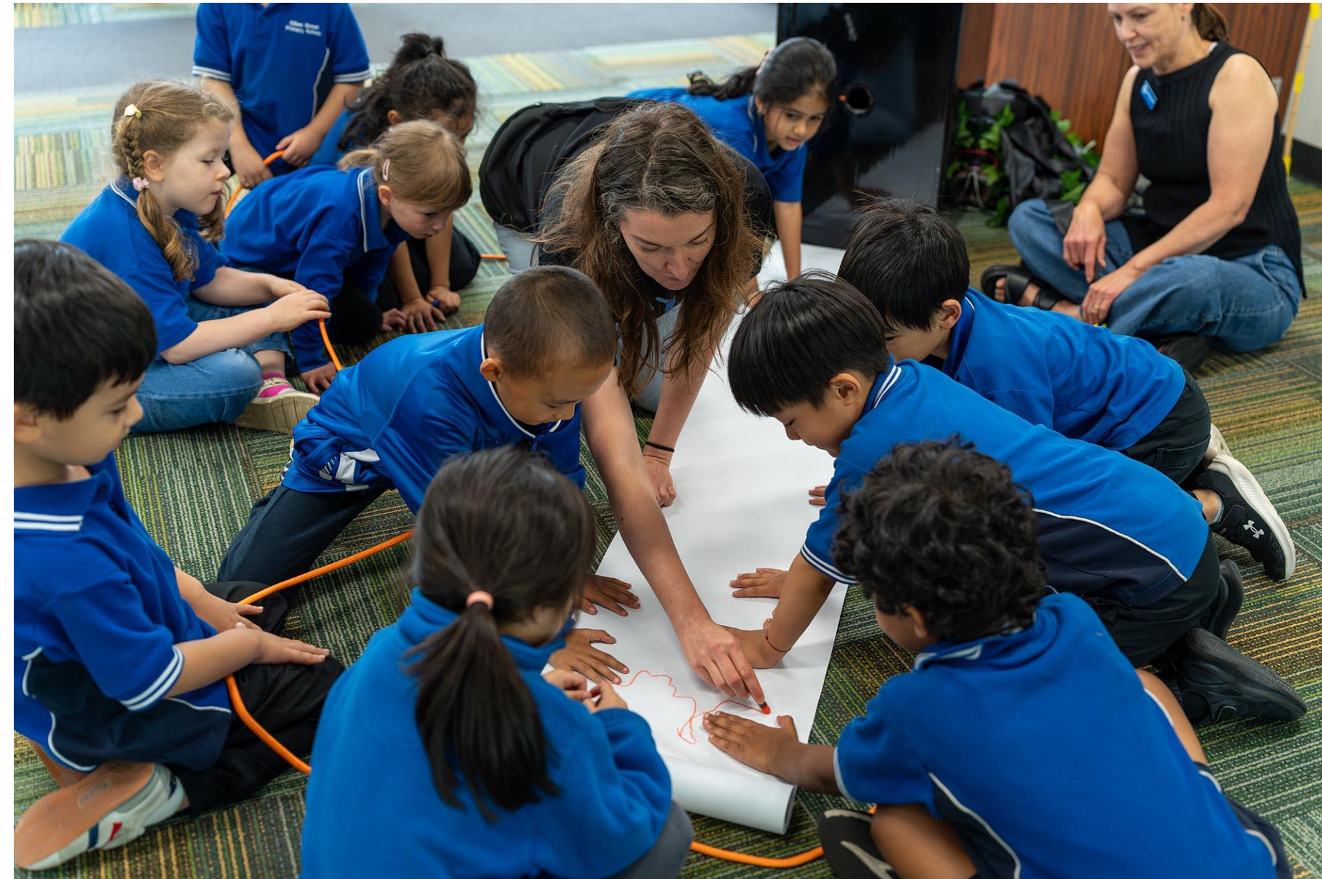
Image description: A group of children sit on the floor drawing on a piece of paper or holding an orange string.

I can express my feelings in a way that is comfortable for me.