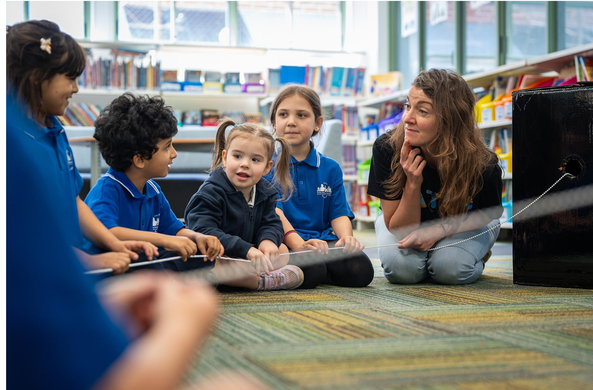
Image description: A group of children sitting on the floor next to an adult who look curious.

The performer may ask me to make sounds. I can if I want to.