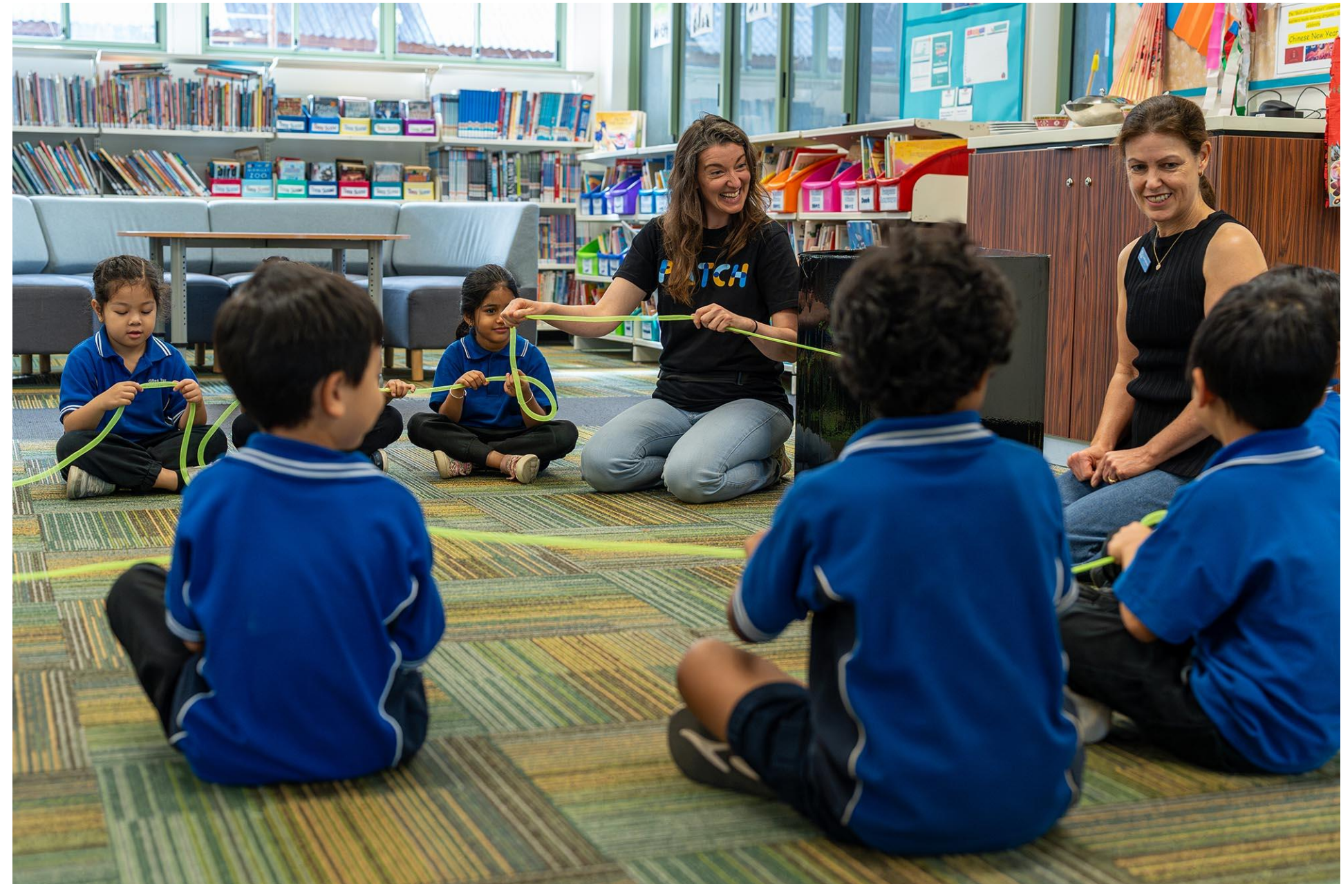
Image description: A group of children sit on the floor with adults, they are holding a green string.

Patch Theatre is looking forward to seeing you at It's a String Thing!