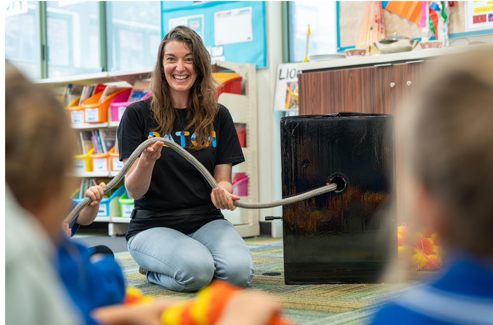
Image description: A person wearing jeans and a t-shirt sitting next to a black box holding a length of grey rope.

There will be space for us to move. There will be space for wheelchairs.