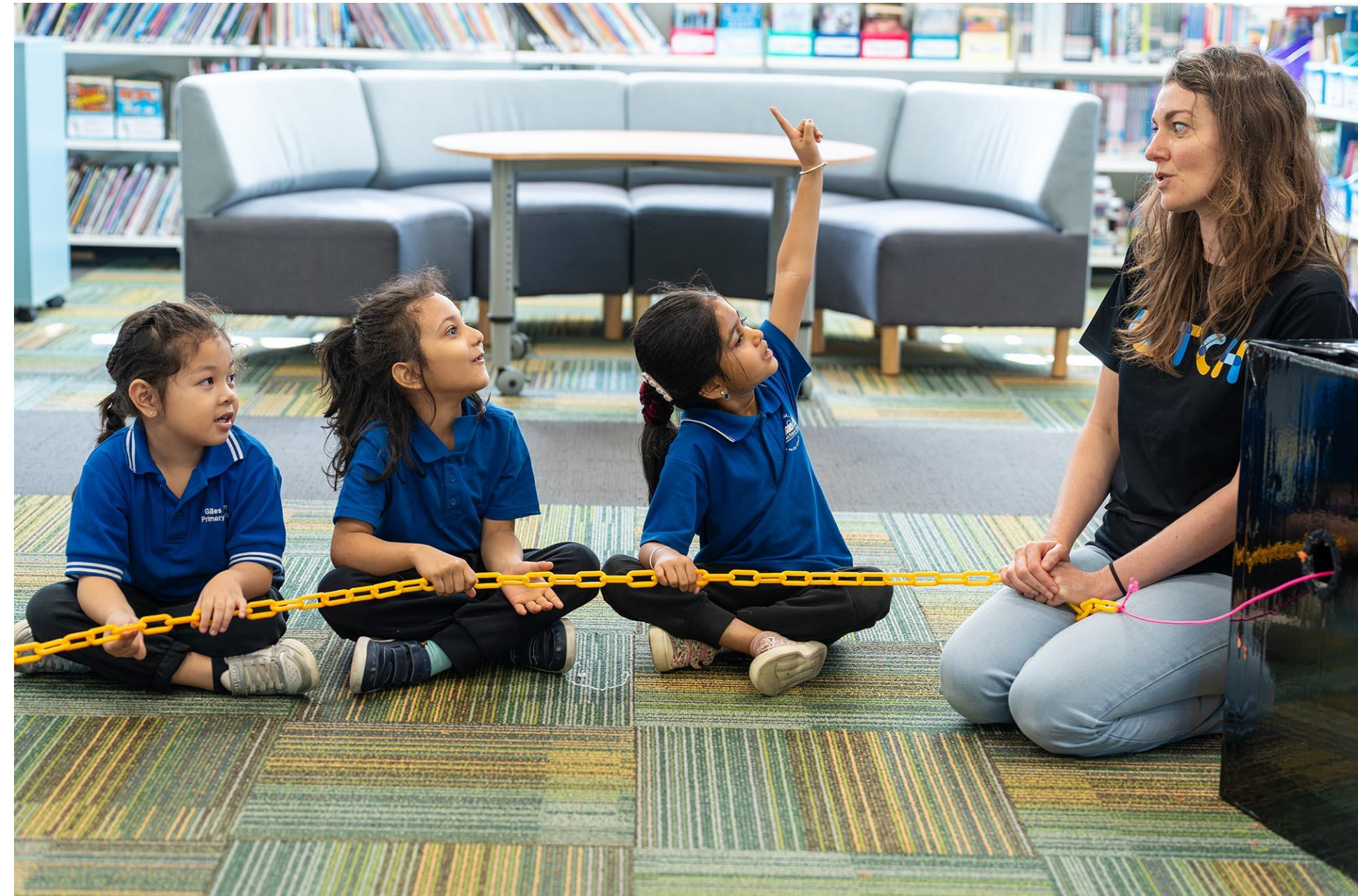
Image description: A group of children sit on a floor with an adult, they are holding an orange chain.