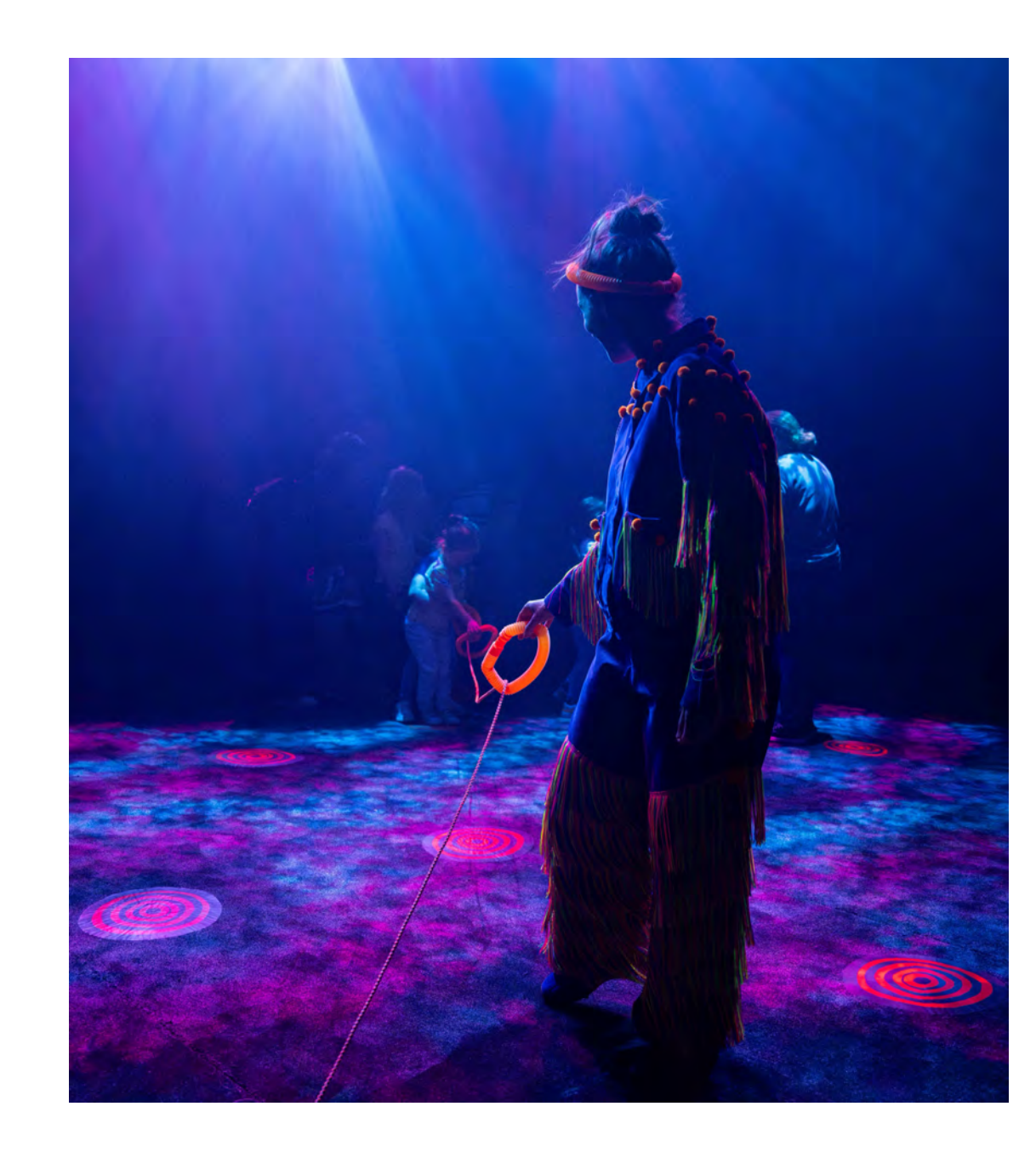
Image description: A person holding a rope with circles of glowing light on the floor.

Gentle music will play. Our performer will hum a tune.