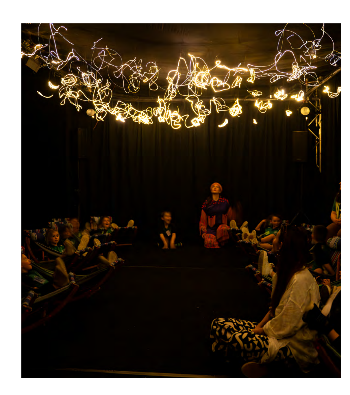
Image description: A group of people sit on the floor in a dark space watching tiny lights above them.

There will be mats for us to lie or sit on if I want to.