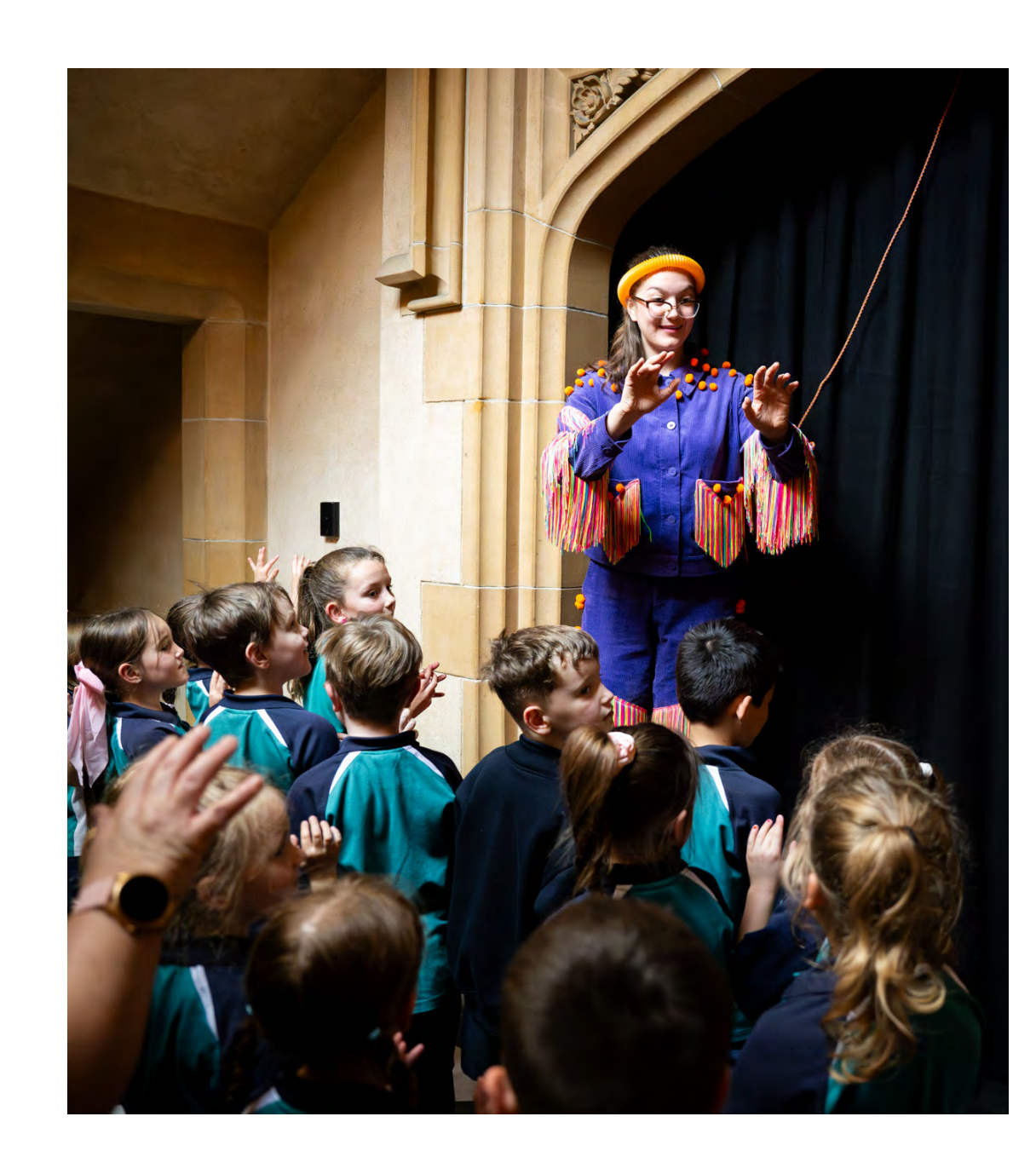
Image description: A group of children watching and listening to a person wearing a colourful costume.

I will listen to the performer who will let me know what to do.