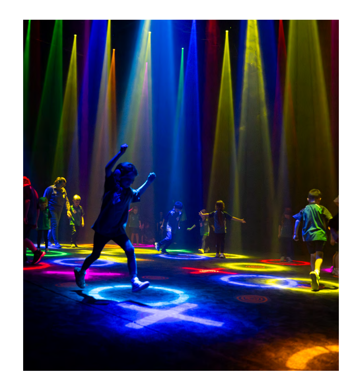
Image description: A group of children dancing in a dark space with colourful lights.