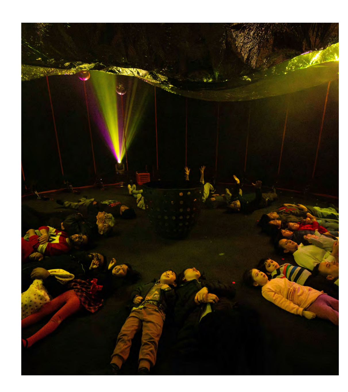
Image description: A group of people lying on the floor with lights shining on a foil cloth floating above them.