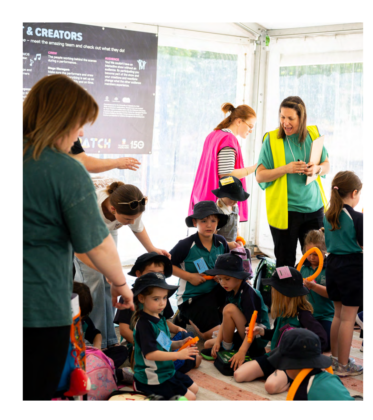
Image description: A group of children and teachers getting ready for the show.

We will put our bags in a safe space. This will let us use our hands to explore and have fun!